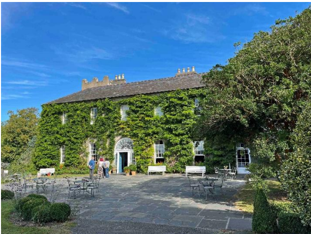
A 100-year-old Chilean myrtle ( Luma apiculata ) anchors the east end of Ballymaloe House