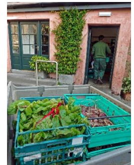
Veggies delivered to kitchen by electric buggy

On arrival, we learned it is much more than a storied, romantic residence: Ballymaloe has emerged as a paragon of sustainability . Heating and hot water, for example, are provided by biomass boilers powered by straw grown in surrounding fields. (They claim not to have used fossil fuels for such purposes since 1984.) Arrays of solar panels supply more than half of Ballymaloe's electrical needs. Staff members navigate the sprawling grounds by bicycle or electric buggy. Surrounding the house are 300 acres of orchards, vegetable gardens, pastures, meadows, native woodlands and wetlands, all managed by ecologically exemplary practices.