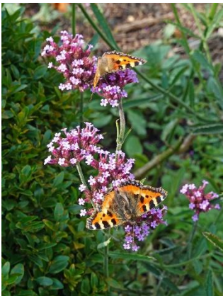
Tortoiseshell butterflies ( Aglais urticae ) feeding on Verbena bonariensis

I gleaned a pair of takeaways from walking and talking with Tobias. 1. Exotic plants can sometimes fill vital niches and voids created by environmental degradation. One of Ireland’s prettiest native butterflies, the small tortoiseshell ( Aglais urticae ) is in rapid decline in Western Europe, but during my visit it abounded in the informal gardens around the estate. Its specific epithet, urticae , means “of nettles”, referring to its host plant, the common nettle ( Urtica dioica ), which has been encouraged to proliferate in Ballymaloe’s meadows and fields. But here I witnessed it feeding happily on Verbena bonariensis , a hard-working South American immigrant whose long bloom time is greatly appreciated by the butterflies. 2. Native forests must be expanded, nurtured and managed with diversity in mind: It comes as a shock that verdant Ireland, the Emerald Isle, is one of the least forested nations in Europe 4 . Ballymaloe is restoring its woodlands with emblematic trees native to County Cork: oak and alder , ash and birch, hazel and holly, pine and yew.