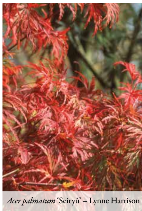
Acer palmatum 'Seiryū' – Lynne Harrison

reds and oranges with undertones of gold in autumn. 'Viridis' is a moderate grower and will quickly outgrow all but the largest of containers. Elegant and graceful, trees from the Dissectum Group only improve with age. The weeping branches develop into sculptural masterpieces over time and are best carefully pruned to not ruin their attractive form.