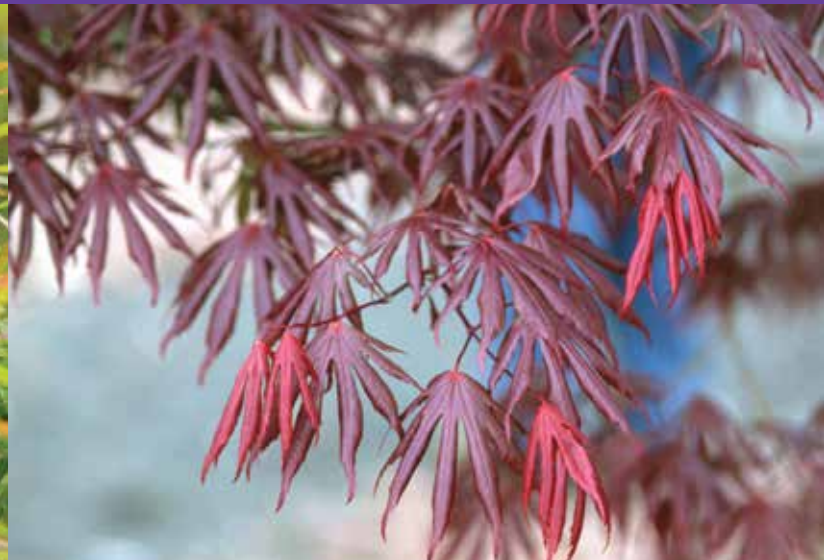
Acer palmatum 'Trompenburg' – Miller Garden

Surprisingly, the fragile appearing 'Fairy Hair' is actually an easy to grow cultivar making a wispy vase-shaped tree 6 to 8 feet tall in ten years. 'Villa Taranto' has been a favorite of mine since I first laid eyes on it as a nursery worker in the early 90's. This cultivar is a small tree, 8 to 10 feet tall, with a broad vase-shaped crown and lush green leaves tipped on the end with red-blushed foliage. All three of these cultivars have great fall color with a mix of reds and oranges. My favorite from the Linearilobum Group is 'Red Pygmy', a slow growing tree from 12 to 15 feet tall with a lacy, delicate rounded crown. The new growth emerges bright red and fades to a red blushed leaf by early summer, then becomes a flaming crimson in autumn.