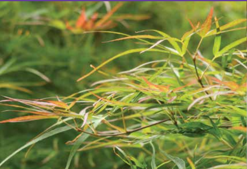
Acer palmatum 'Villa Toranto'