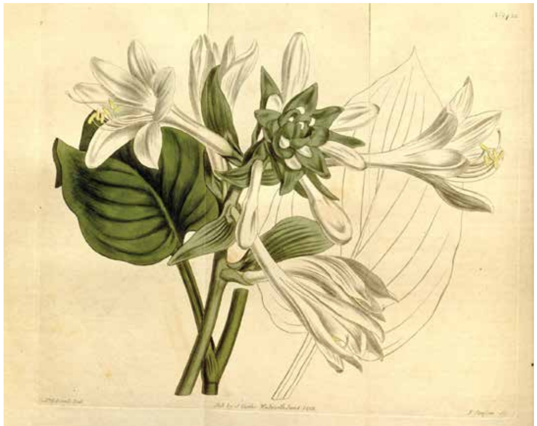
Botanical Illustration of Hosta plantaginea – Wikipedia Commons

Generally, Hosta plantaginea is not widely available in the trade so the closest we gardeners can get to having it in our gardens is the cultivar 'Royal Standard', a cross with H. sieboldiana . Slightly more robust than the species, it performs better in the north than its heat-loving parent.