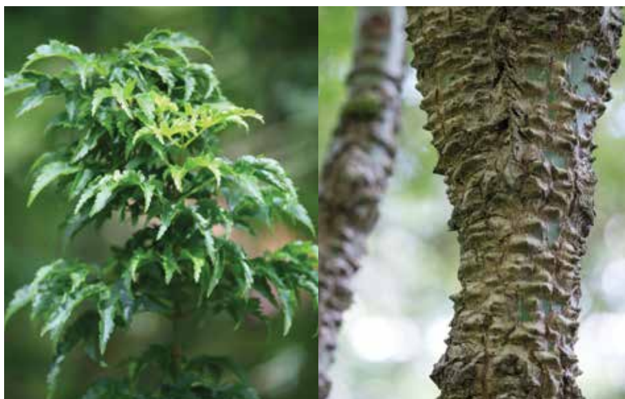
Acer palmatum 'Shishigashira'

from hanging on the maple's branches. Another selection gaining popularity is Acer palmatum 'Bihou' with golden yellow and orange bark on its younger branches. This too seems to share the narrow form of the coral bark maple, but time will tell.