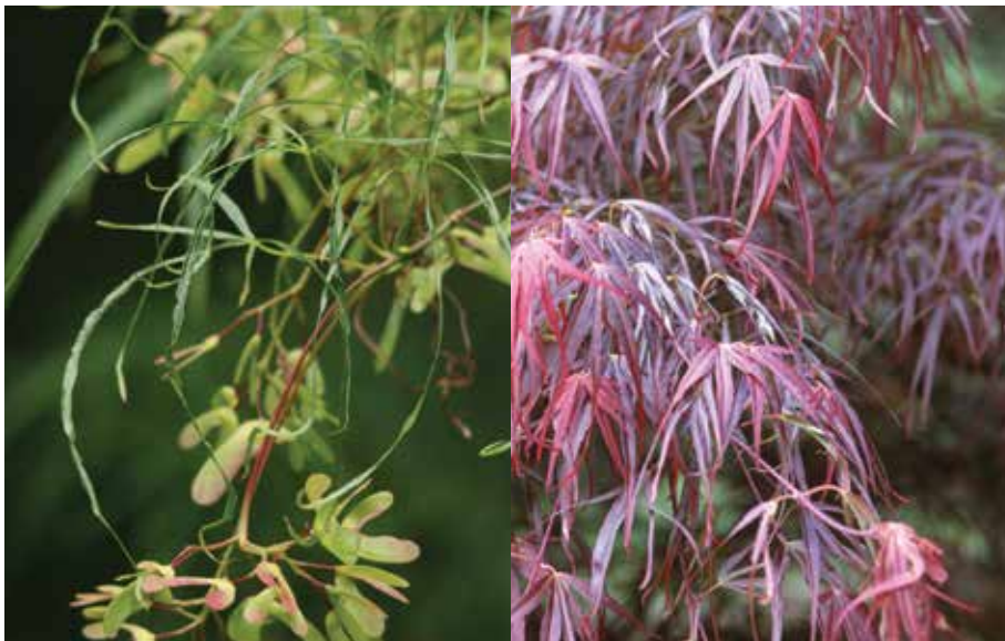
Acer palmatum 'Koto-no-ito'

Commonly called lion's mane maple, this upright grower has its leaves in tight, congested bundles surrounding the branches. This slow growing variety has been chosen as a Great Plant Picks selection and makes a very useful plant in the smaller garden. The narrow vase-like form allows easy placement in most garden spaces. In ten years, it can reach 6 to 8 feet tall, but older trees can be 15 to 18 feet tall with time.