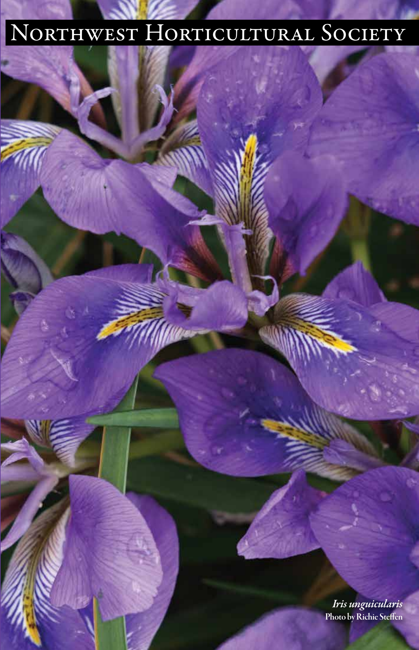
Iris unguicularis