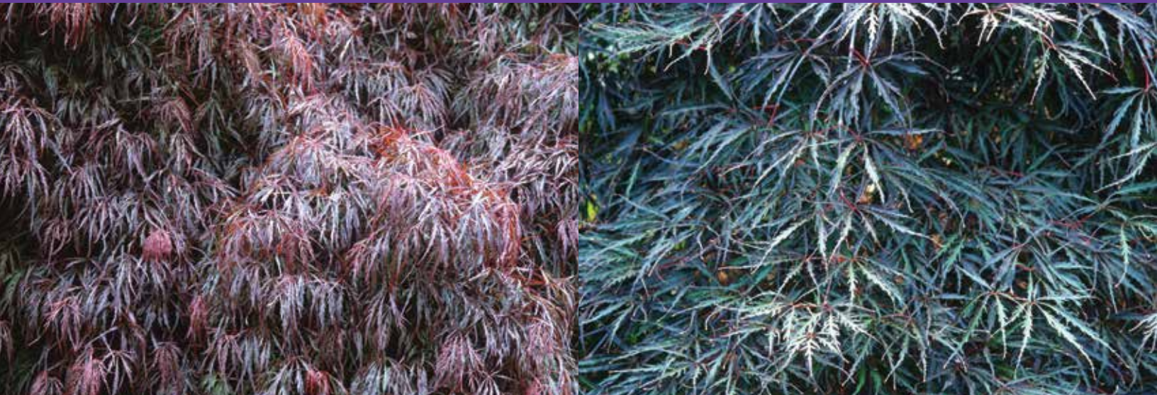
Acer palmatum 'Crimson Queen' – Miller Garden