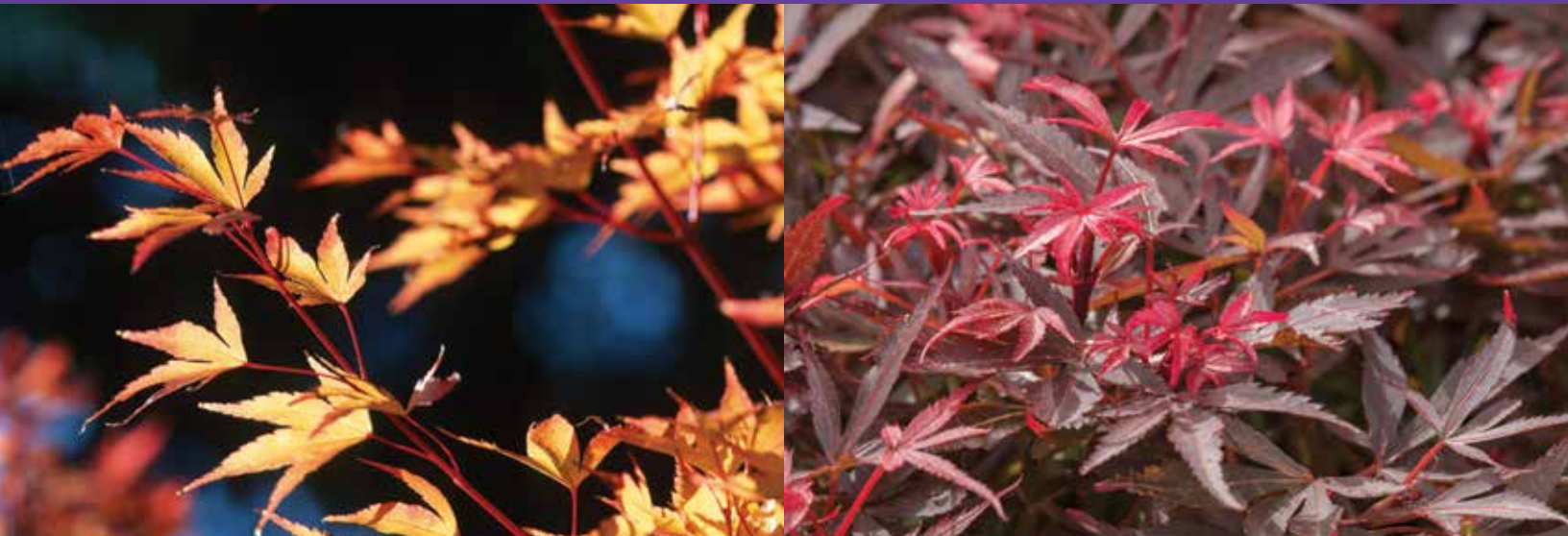
Acer palmatum 'Sango kaku' – Miller Garden