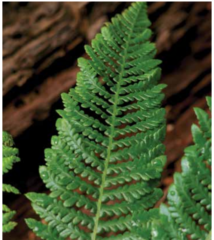
Blechnum spicant 'Rickard's Serrate'