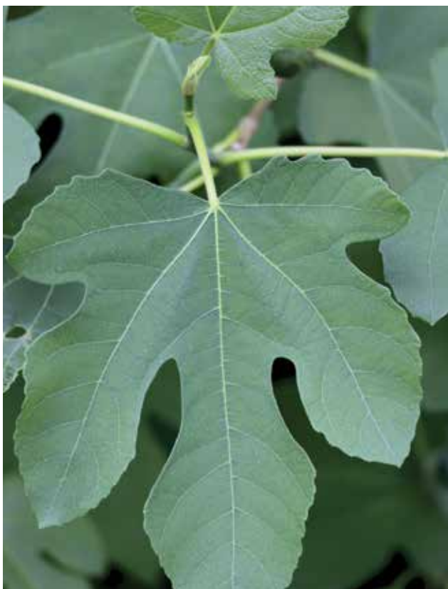
Ficus carica – Fig Leaf

ably 'Desert King' since figs outside the Mediterranean basin are all sterile.