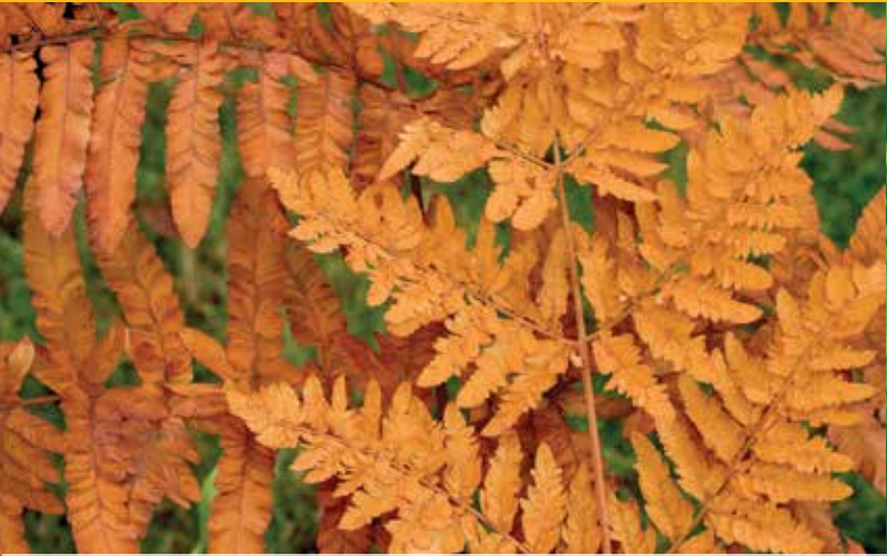
Osmunda regalis 'Decomposita'