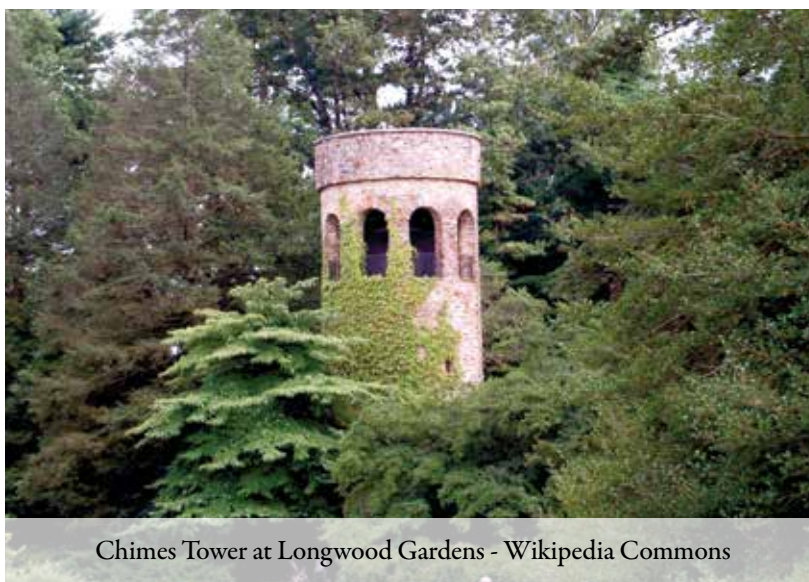
Chimes Tower at Longwood Gardens