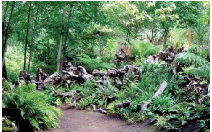
Pat & Walt Riehl Garden

Pat & Walt’s property is six acres with most left in its natural state. When they bought the land in 2006 there was bamboo, nettle and a weedy lawn. The garden started with a fern stumpery in 2007, inspired by a visit to The Stumpery at Highgrove Royal Gardens in the United Kingdom. Lush garden beds followed from areas of the lawn and were dug out by hand. Collections of choice epimedium, small conifers, ferns, scheffleras and saxifrages are abundant amidst a myriad of other plants in the stumpery and garden beds. The garden continues to be refined and expanded in a serendipitous fashion. ∞