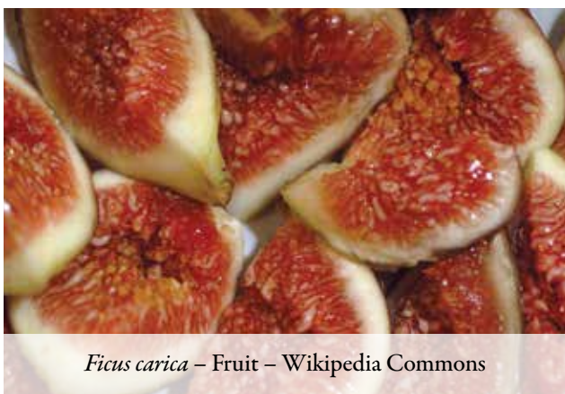
Ficus carica – Fruit

ers fresh. Most are dried or canned. We dry our figs and make jam, but not until we are sickeningly full of ripe ones. Maybe, as our summers get warmer and longer, we will be able to try other figs, too.