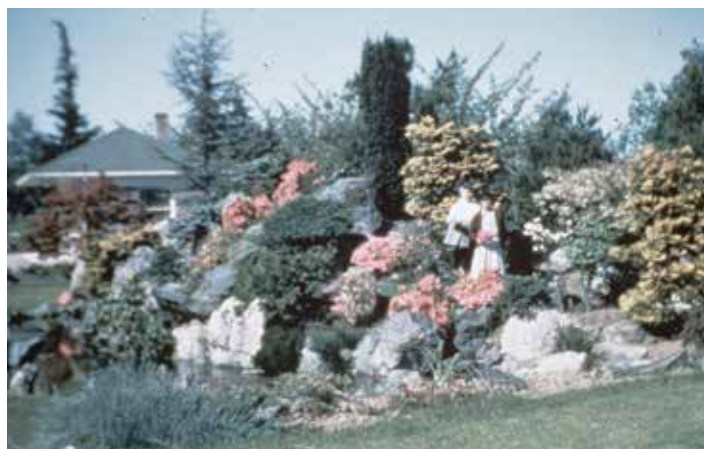
Mukai Farm & Garden – Historic Image – – Washington Trust – Friends of Mukai