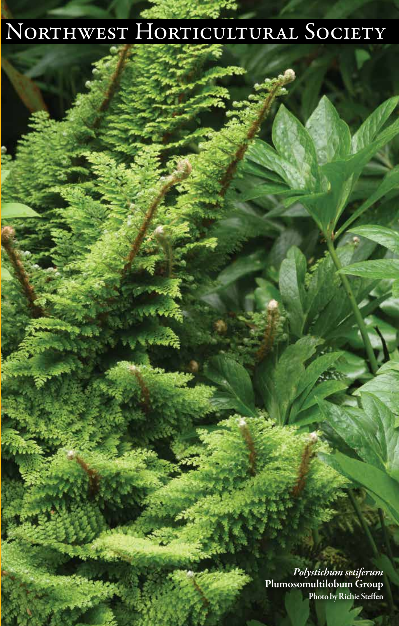
Polystichum setiferum Plumosomultilobum Group