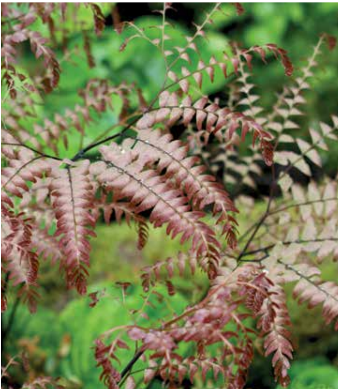
Adiantum aleuticum 'Japonicum'