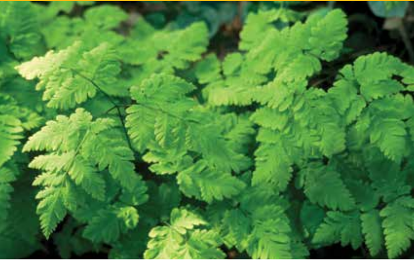
Gymnocarpium dryopteris 'Plumosum'

botanical institutions from across the country.