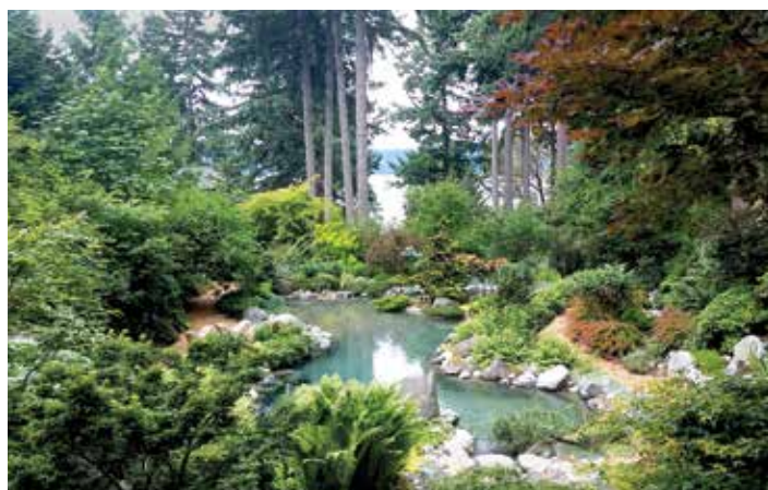
Whit & Mary Carhart Garden

Over the past 20 years, Whit and Mary Carhart have created a 2.5 acre sloped Northwest style garden on wooded acreage which overlooks Quartermaster Bay. Multiple sculptures accent the garden with diverse woodland plants, Japanese maples, rhododendrons, and unusual conifers amongst unusual perennials, grasses, and ferns. Paths have sitting places to reflect on naturalistic plantings around the hillside waterfall and pond. An antique Indonesian garden shed adds an Asian touch to the garden. Visitors should wear comfy shoes and be prepared to walk on gentle slopes and/or stairs.