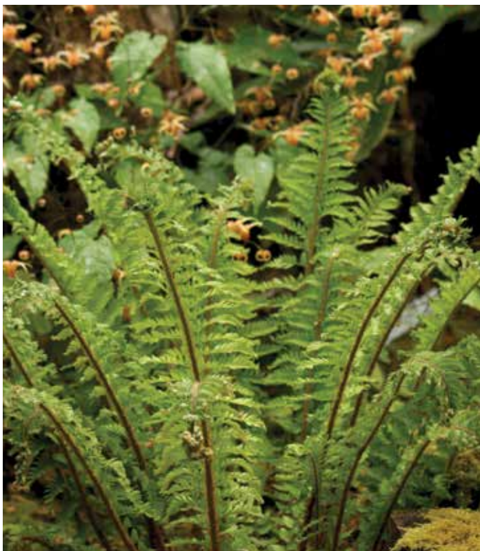
Polystichum aculeatum Cristatum Group

We enthusiastically invite you to visit our recently updated colorful website, www.hardyferns.org , where you’ll find in-depth details about “all things ferny” from the scientific to horticultural. You can see photos and learn more about the HFF and its affili-