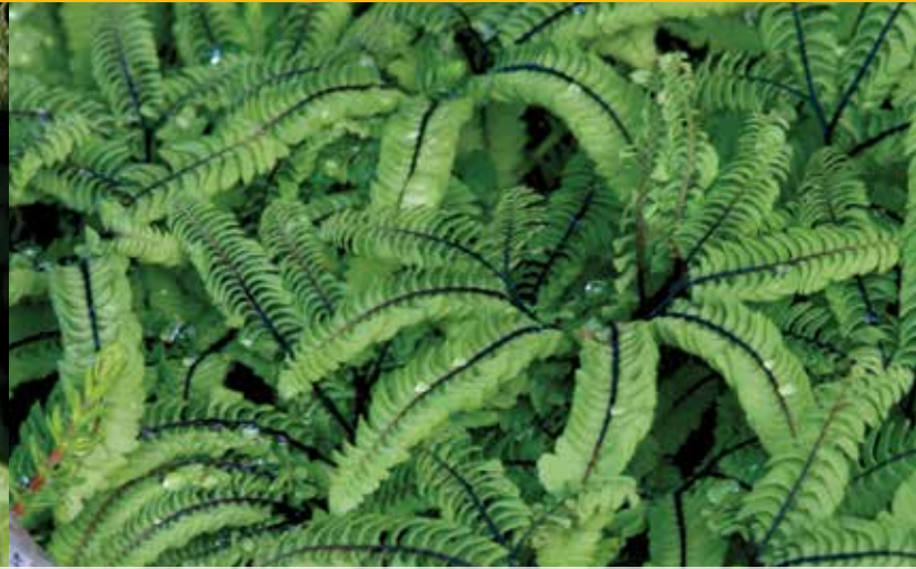
Adiantum aleuticum 'Subpulum'

ates, further resources, and membership plant distribution as well as upcoming events of interest.