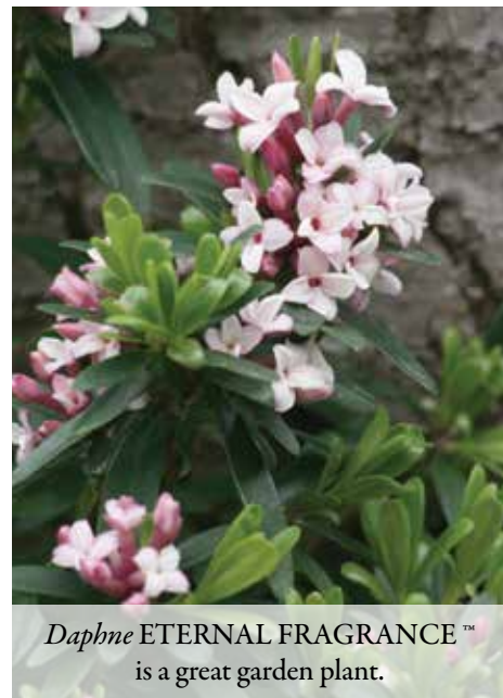
Daphne ETERNAL FRAGRANCE™ is a great garden plant.