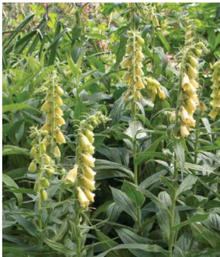
Digitalis purpurea (foxglove), seeds aggressively (left) while Digitalis grandiflora (large yellow foxglove) self-sows much more gently (right).

Using the knowledge of the GPP selection committee members, along with trials and evaluations, sometimes a plant species is turned down not because of insects or disease, but because there are cultivars which have been selected for added qualities or they are more attractive in some way. For instance, Fagus sylvatica (European beech) may be a fine tree, but there are a variety of cultivars with much more interesting forms as well as foliage types. F. sylvatica ‘Pendula’ has the characteristic green leaves, however, the distinctive shape with its downward flowing branches is reminiscent of a waterfall. Then there are the purple leaf forms which are highly attractive: F. sylvatica ‘Dawyck Purple’, a columnar form; F. sylvatica ‘Purple Fountain’, columnar and weeping; and F. sylvatica ‘Riversii’, with leaves larger and the darkest of purple. F. sylvatica ‘Purpurea Tricolor’ has exceptionally unique variegation that emerges dark purple and edged in pink or rose. These are just a few of the selections that