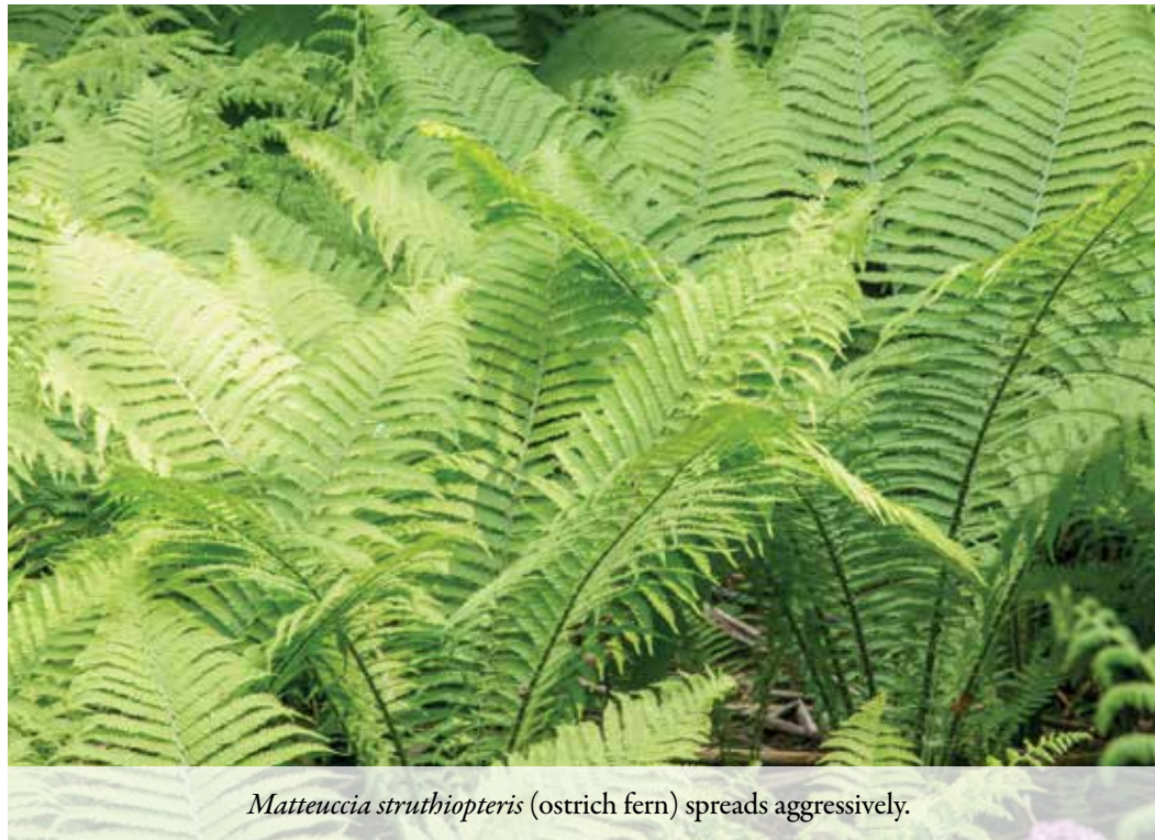
Matteuccia struthiopteris (ostrich fern) spreads aggressively.

Other plants that are eliminated easily are those exotics which are invasive to the