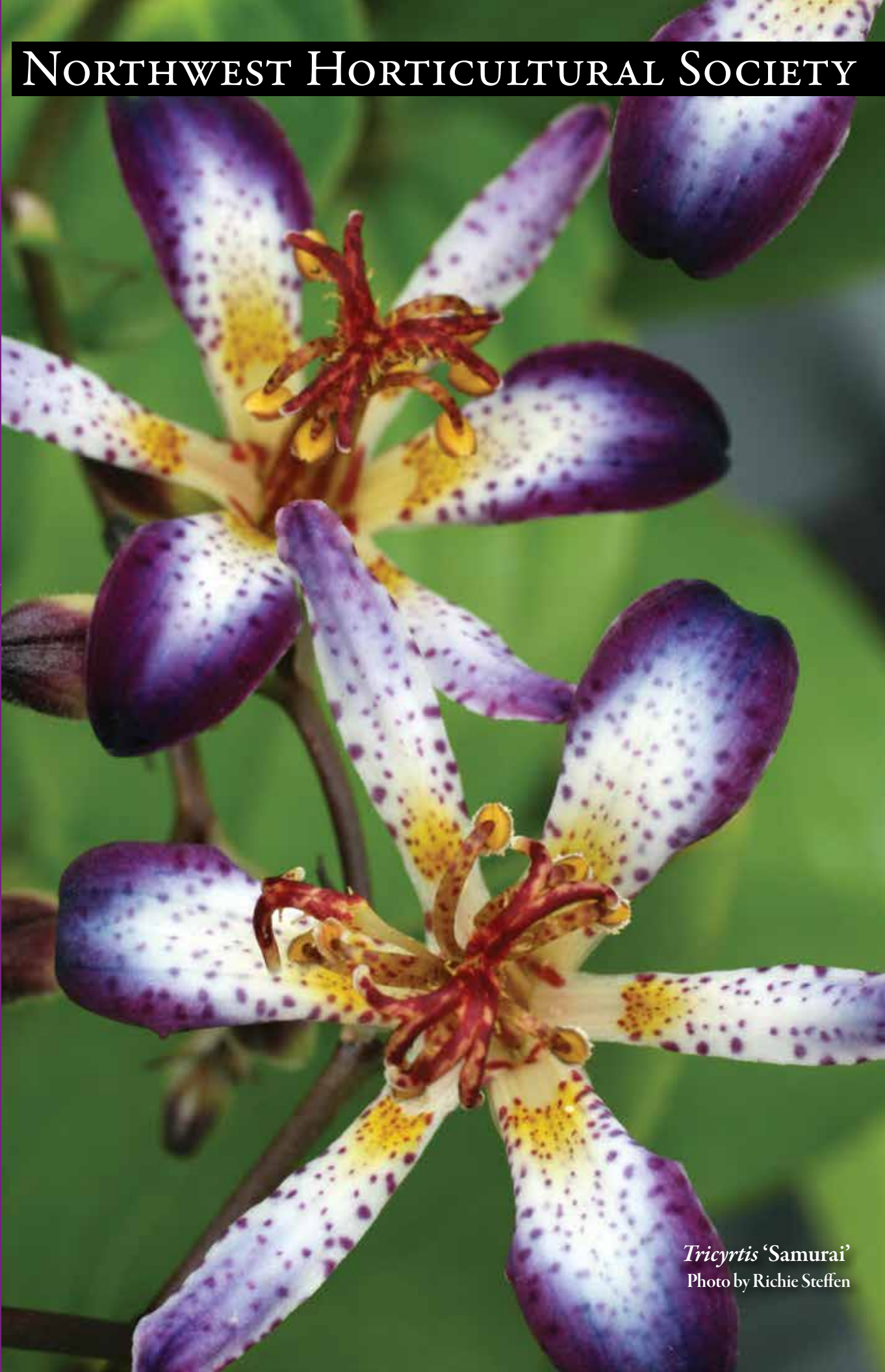
Tricyrtis 'Samurai'