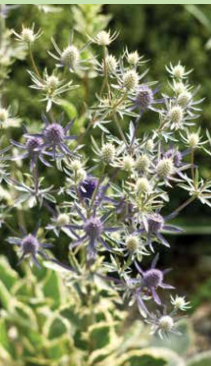
Eryngium planum 'Jade Frost'