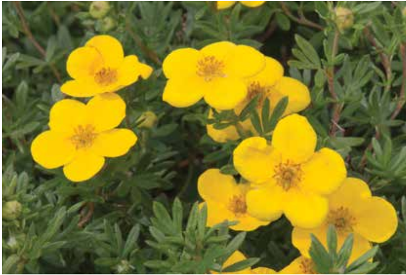
Potentilla (Dasiphora) fruticosa