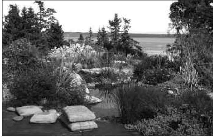
Windcliff (Daniel Hinkley)

Throughout my garden at Windcliff grows a significant number of plants that