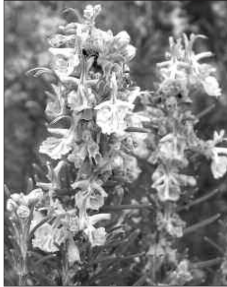
Elba rosemary

Revered by the Greeks for its memory enhancing abilities, scholars wore garlands of rosemary around their heads to help them study. Rosemary, carried at weddings or braided into the bride's hair, is said to ensure fidelity, and at funerals rosemary placed in the coffin is said to ensure the departed is remembered. Modern scientists have found the oils in rosemary to contain over a dozen antioxidants, which may aid in reducing the symptoms of Alzheimer's. These same oils have made it useful as a digestive aid, meat preservative, insecticide, anti-bacterial, and even a mood elevator. But most of us, along