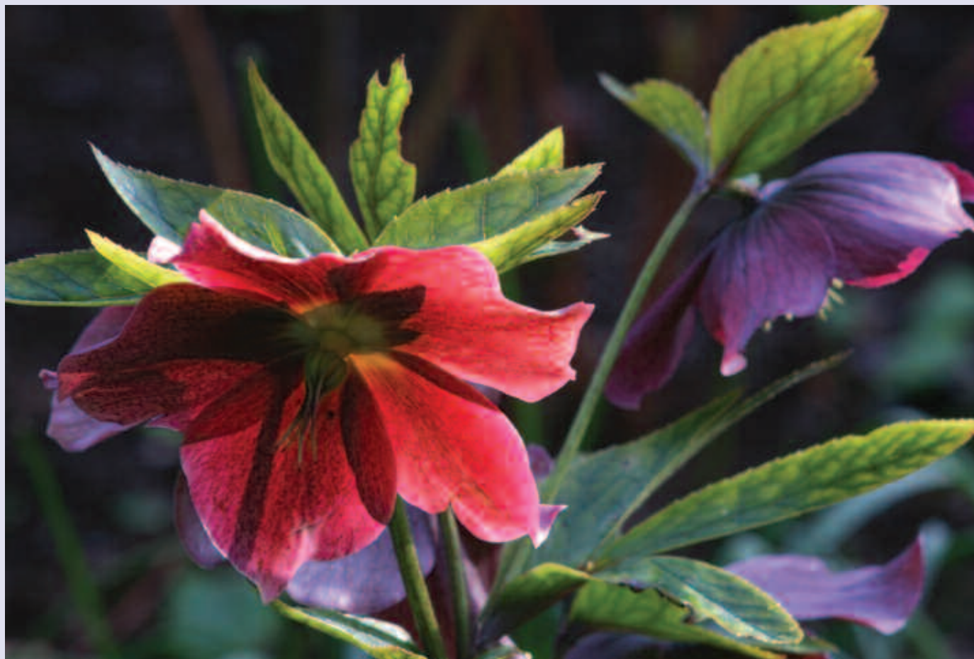
Helleborus × hybridus

"I prefer winter and fall, when you feel the bone structure of the landscape—the loneliness of it, the dead feeling of winter. Something waits beneath it, the whole story doesn't show." Andrew Wyeth, American painter, 1917—